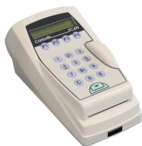
TC4N/TC11N/TCRS magnetic card readers