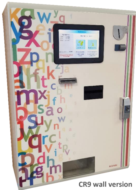
CR9 wall version